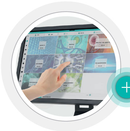
protocol wizards for fast and easy set-up