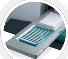
new magnetic plate for reliable miniaturised SPRI bead clean-ups