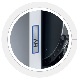
new ergonomic design features

Our mosquito genomics has been the popular choice for NGS labs and core facilities wanting to miniaturise reaction volumes and maximise productivity. Now we are making your favourite pipetting robot even better. mosquito genomics is available with a host of new and exciting features and upgrades: